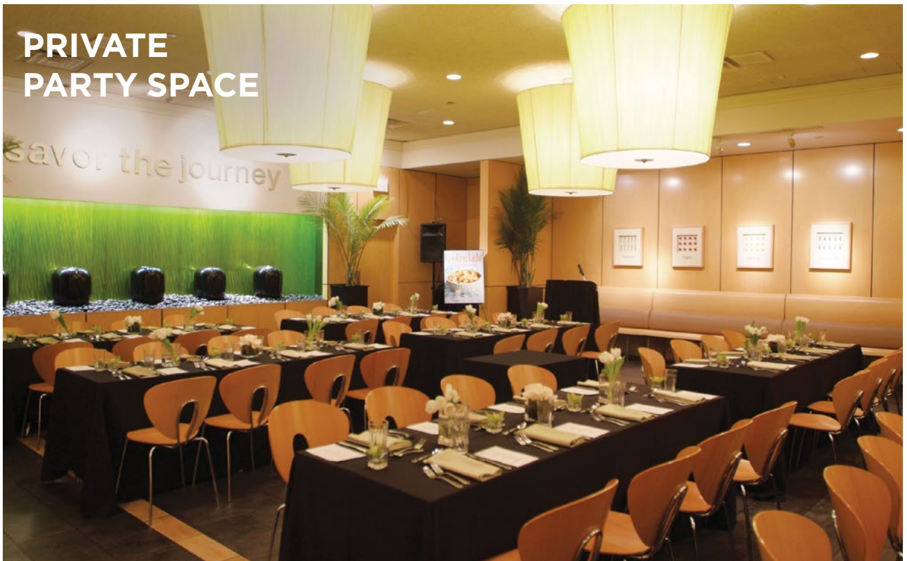
PRIVATE PARTY SPACE